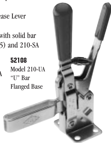
52108 Model 210-UA "U" Bar Flanged Base

Bolt retainer supplied with solid bar Models 207-SA (207105) and 210-SA (210114), and flanged washers supplied with "U" bar Models 207-UA (507107) and 210-UA (235106). Spindle assemblies are not included.