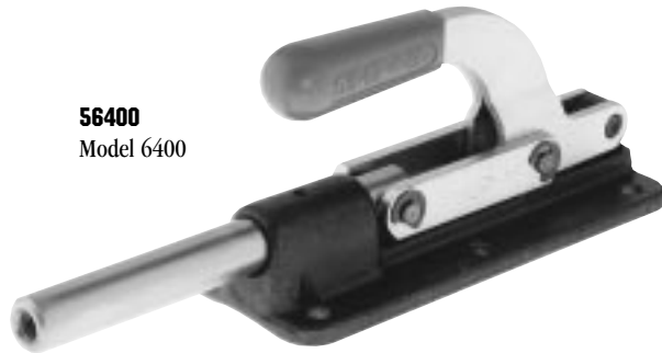
56400 Model 6400

This straight-line action clamp is designed for heavy-duty service and offers a full 4" plunger travel, the longest of all the DE-STA-CO 600 Series straight-line action clamps. The 7/8" diameter plunger is drilled and tapped for a 1/2-13 adjustment spindle and locks in either the extended or retracted position. The low silhouette clamp is only 4 3/8" high for use where overhead clearance is a problem. Supplied with ergonomic handle grip. Metric Plunger available with M12 internal thread.