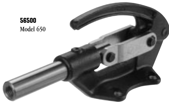
56500 Model 650

Largest holding capacity of the straight-line action clamps. Model 650 is precision built with forged alloy steel handle and base. Snap ring pivot pin construction allows easy removal of plunger even after unit is mounted. Locks in either the extended or retracted position. Plunger is tapped to accept any 5/8-11 spindle or detail. Metric Plunger available with M16 internal thread.