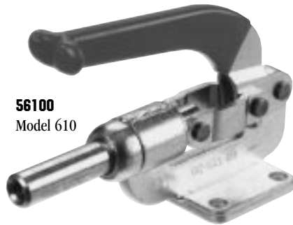
56100 Model 610

Features DE-STA-CO balanced construction for rigid holding and assured long life. Plunger tip is drilled and tapped to accept any 3/8-16 accessory. Model 618 is similar except for straight base and removable base bracket which may be positioned for varied angular clamping. Handle grip is red vinyl-dipped. Plunger locks in both the retracted and extended positions. Metric Plunger available with M10 internal thread.