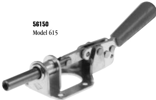
56150 Model 615

Similar to Model 605, except with reverse handle action. Plunger locks in the forward position only as the handle is moved downward. Ergonomic handle grip for greater operator comfort. The plunger is tapped to accept any 5/16-18 threaded accessory.