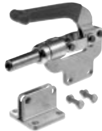
56180 Model 618 Straight Base Supplied with F618 Base Bracket