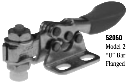
52050 Model 205-U "U" Bar Flanged Base

The smallest of the horizontal handle, horizontal bar clamps. Supplied with nylon spindle assembly (105203). Flanged washers (105106) supplied with "U" bar models. Stainless steel models supplied with stainless steel hex-head spindle assembly (205943). Handle grip supplied on the non-stainless clamps only.