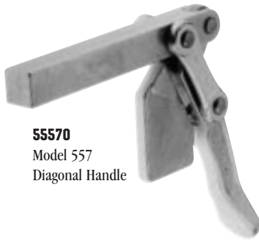
55570 Model 557 Diagonal Handle