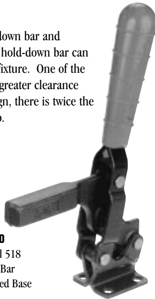
55180 Model 518 Solid Bar Flanged Base

This model features a forged hold-down bar and ergonomic plastic grip. The forged hold-down bar can be cut or welded to suit the user's fixture. One of the major features of this clamp is the greater clearance under the bar. Due to the bar design, there is twice the normal clearance in this size clamp.