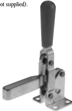
52100 Model 210-U "U" Bar Flanged Base

Popular because of its size and holding capacity. Ergonomic handle grips are included for greater operator comfort. Two flanged washers (235106) included with "U" bar models, and bolt retainer (210114) supplied with solid bar models. Accommodates any 3/8" spindle (not supplied). See pages 69-73 for accessories.